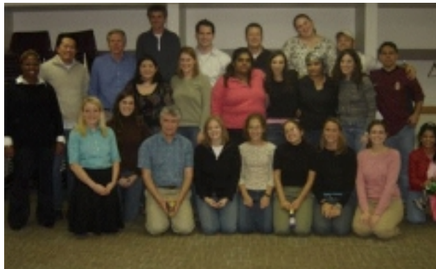
University of Iowa - Cultural Potluck event