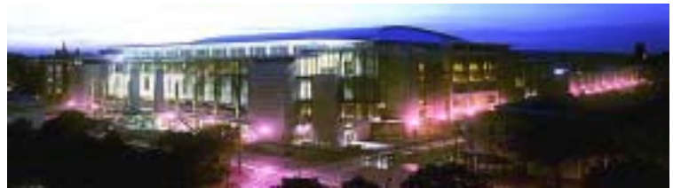
Washington, DC Convention Center ( http://www.dconvention.com/ )

APAGS Suite (Grand Hyatt) Thursday, August 18 9:00-9:50am