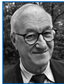
ALBERT BANDURA, PH.D.