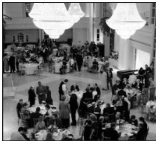
APF GUESTS DINE IN THE ELEGANT ARCADIAN COURT.