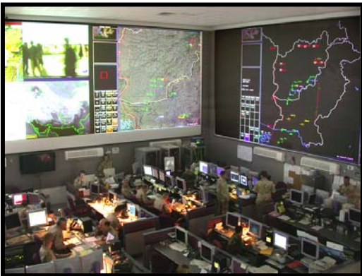
Figure 1. Air and Space Operations Center

The AOC is the interface between the operational art of war and tactical execution; operators are expected to be versed in professional knowledge gained from professional military education and reading. The AN/USQ-163-1 Falconer system, the formal designation of the AOC weapon system, consists of over 40 systems and applications which are used by the various operators. Joint and aerospace doctrines are also required knowledge areas for AOC operators.