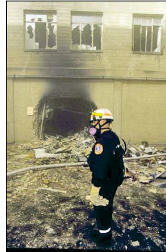
Scene outside the Pentagon's C Ring after 9/11 attack