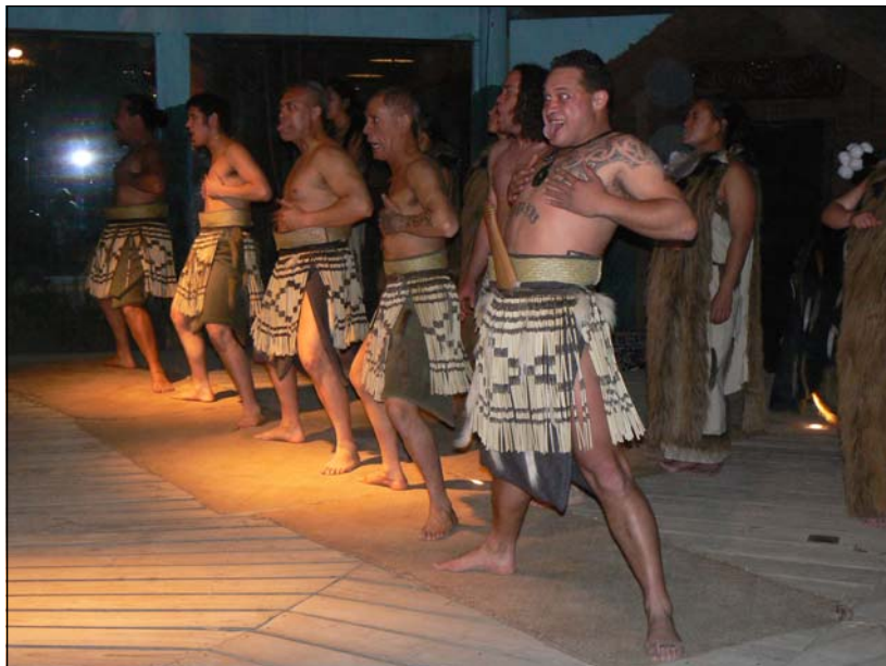
Maori presentation at 2006 I SCP meeting in New Zealand