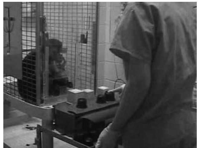
Figure 3. The experimenter places her finger on the baited cup in her array as the monkey watches in the choice phase in the relational matching task with dissimilar stimuli. Note that the experimenter's set is composed of black cylindrical cups and the monkey's set is composed of yellow rectangular cubes.

In the final transfer phase, the subject was presented with relational matching with distracter trials that had an additional modification. In this phase, the experimenter's set of stimuli differed in color, shape, and size from the subject's set (see Figure 3). For example, for each trial in a session, the experimenter's set of stimuli consisted of three black cups of varying sizes and the subject's set consisted of three yellow cubes of varying sizes. In this phase, all trials involved sets of three stimuli (or three choices). A correct search required using a relational size rule to match physically dissimilar stimuli (i.e., the largest black cup with the largest yellow cube). The subject was presented with three of these transfer sessions, for a total of 33 trials.