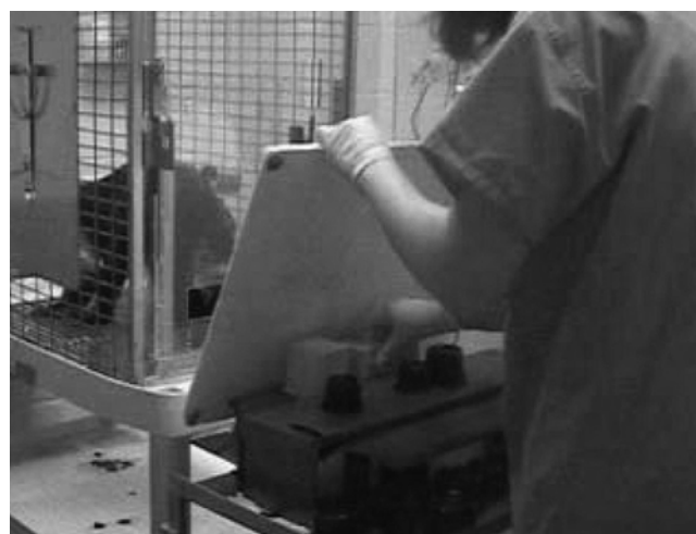
Figure 2. The experimenter places an opaque barrier between the monkey and the experimental apparatus while she baits her cup and the monkey's cup. The photograph also shows the arrangement of stimuli on the experimenter's shelf (above) and the monkey's shelf (below).

Before the start of a trial, the experimenter hid food under the appropriate cups, out of the subject's view. The experimenter then gained the subject's attention and revealed a food item that had