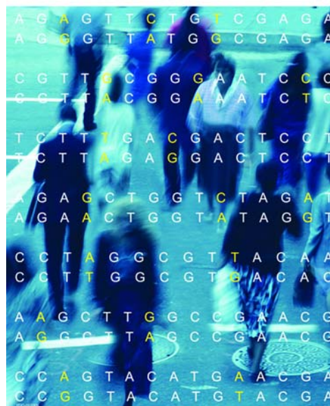
The International HapMap Project has identified 3.1 million single nucleotide polymorphisms (SNPs). In some cases, these tiny differences in DNA sequence may increase susceptibility to, or confer resistance against, disease. (US Department of Energy Genome Programs, http://genomics.energy.gov )

GWAS are extremely powerful because they are unbiased and comprehensive: they can implicate a known gene in a disorder, and they can identify genes which may have been overlooked or previously unknown. Building on GWAS results, scientists gather additional evidence from affected families, animal models, and biochemical experiments to verify and understand the link between a gene and risk for a disease.