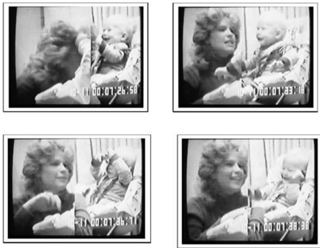
Figure 1 Mother and Infant Interaction

Note. Left to right: The infant pulls the mother's hair. When the mother disengages, the infant holds on, and the mother responds with an angry facial expression and vocalization. The infant reacts defensively. After some seconds, they both repair the interaction.