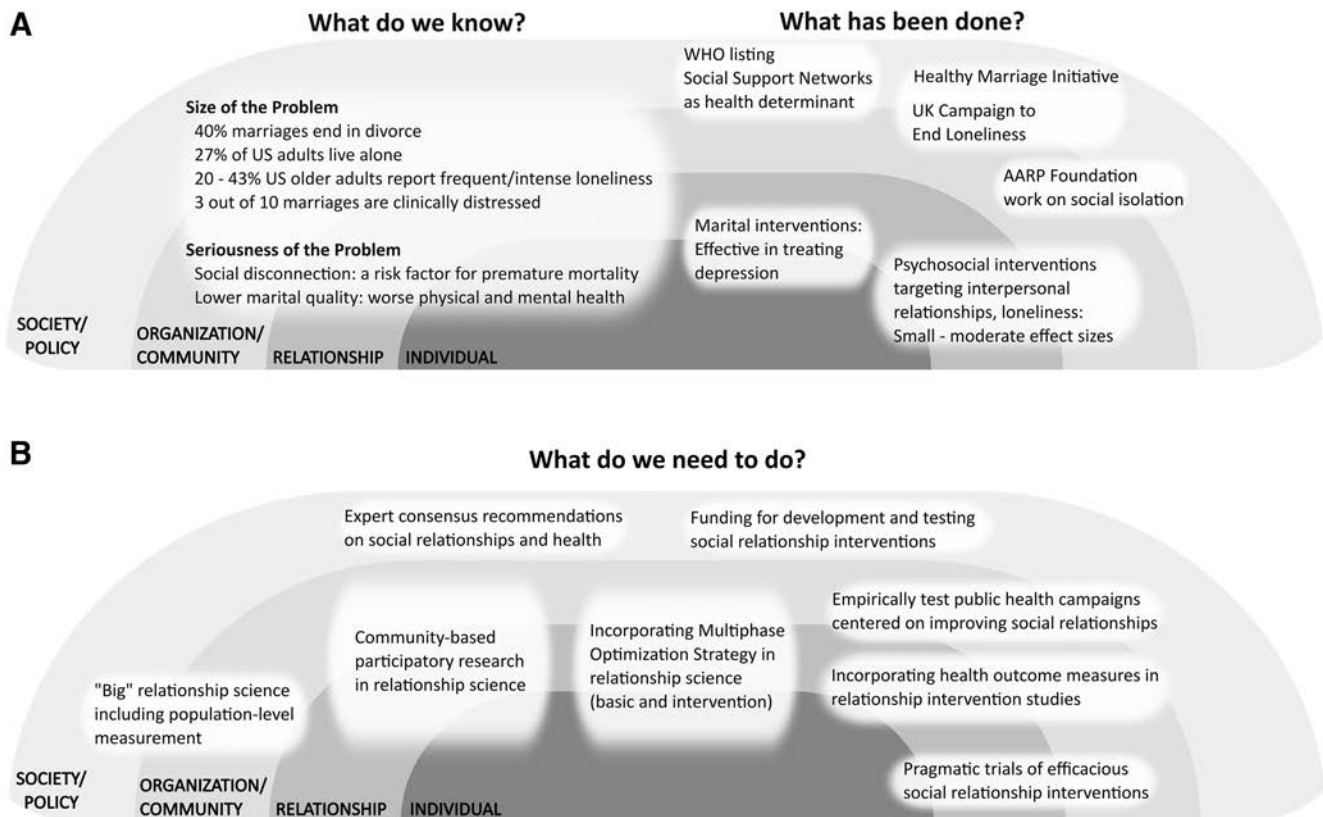
Figure 2. Panel A: The state of relationships and health science embedded in a social ecological model. Text boxes are positioned in their respective levels of analysis (individual, relationship, organization or community, society or policy), and some boxes span multiple levels (i.e., individual and relationship). WHO = World Health Organization; UK = United Kingdom; AARP = American Association of Retired Persons. Panel B: Recommendations for researchers, government agencies, health care providers and associations, and public or private health care funders to integrate social relationships into current public health priorities.

ness for clinical, research, and population-monitoring purposes as did race or ethnicity, education, physical activity, tobacco use, and neighborhood characteristic measures. The same process could help identify measures in other domains, because brief scales assessing social connection-related constructs that are suitable for epidemiological studies are now available (Cyranski et al., 2013; Hahn et al., 2010).