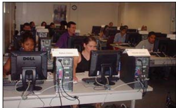
ASTP 2005 participants learn how to complete statistical analysis with SPSS