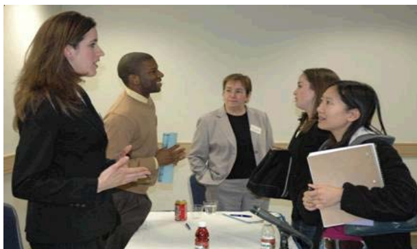
Expert panelist at the George Washington University Academic Career Workshop share their experiences and personal stories with students.