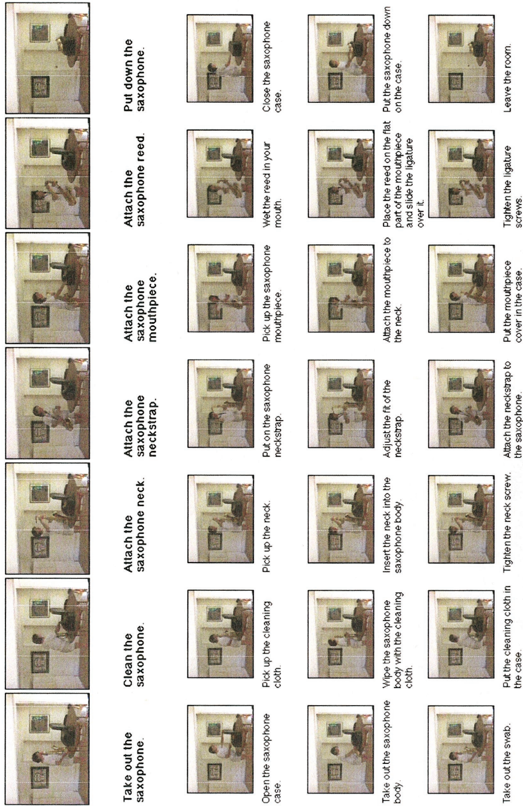
Figure 1. Computer interface for teaching how to assemble a saxophone (Experiment 1). Shown is the layout of the left of two monitors; the right monitor was used to present still pictures or video demonstrations. The 21 small parts of the procedure were arranged across the screen, top to bottom and left to right in rows of 3. In the structured version of the interface (shown here), each of the 7 large parts was depicted above the 3 small parts that made it up, with a larger picture and font; in the unstructured version, these were omitted. Pictures were present in the still picture and video conditions; in the text-only condition, these were omitted. In the still-picture condition, clicking on one of these pictures caused a larger, more detailed picture to be shown on the right monitor. In the video condition, clicking on a picture caused a video demonstration of that part to be shown on the right monitor.