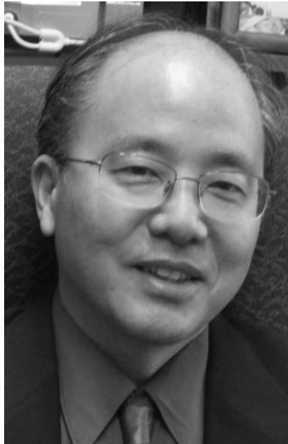
Bert N. Uchino

implications of the major integrative peripheral physiological pathways linking close family relationships to health, as well as outlines a model for how neurochemical pathways may mediate between them. Close family relationships are broadly defined as those characterized by frequent, strong, and enduring interdependence (e.g., long-term romantic or cohabiting relationships, immediate family members, Kelley & Thibaut, 1978). These close familial relationships are more likely to influence the long-term development and course of chronic health conditions because of their stability and importance (Uchino, 2009).